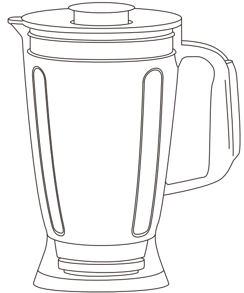
PART# 1.8L PLASTIC BLENDER JAR